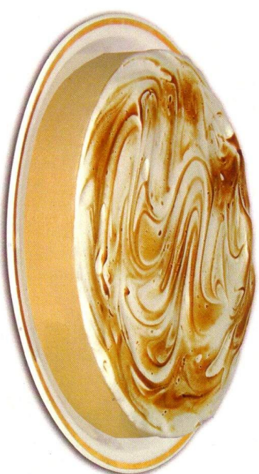
0406 Torta Cappuccino