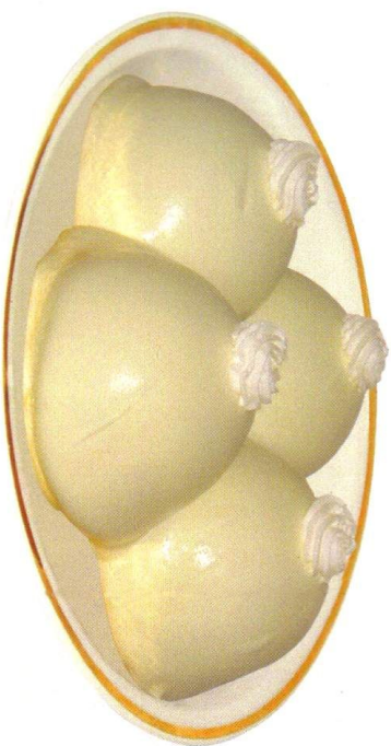
0403 Delizie al Limone

Torte al dettaglio in una comoda ed elegante confezione salva freschezza